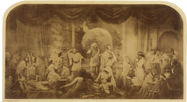
Two Ways of Life , 1857, Oscar Gustave Rejlander (British, born Sweden, 1813 - 1875). Albumen silver print. Image: 21.8 × 40.8 cm (8 9/16 × 16 1/16 in.). EX.2019.5.36. Moderna Museet, Stockholm

Despite this support from the Royal Family, Two Ways of Life divided the photographic community, with professional photographers considering it a technical tour de force, and amateurs seeing it as not only artificial in production but also immoral in its subject. However, it remains one of finest examples of combination printing to come from this period.