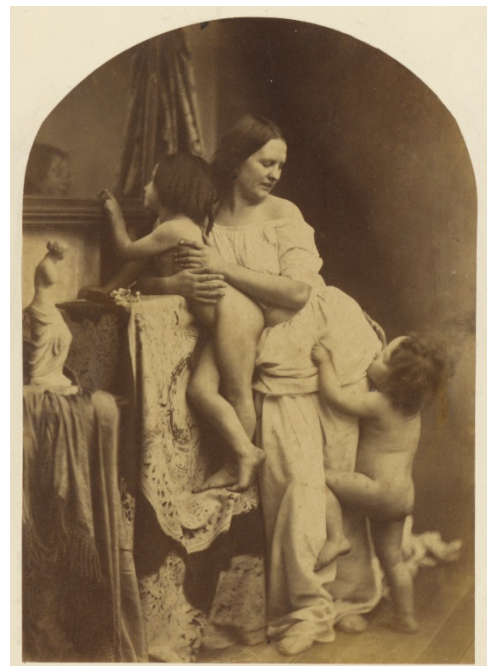
Madonna and Child with St. John the Baptist , about 1860, Oscar Gustave Rejlander (British, born Sweden, 1813 - 1875). Albumen silver print. Image (arched): 17.8 × 12.4 cm (7 × 4 7/8 in.). 84.XM.845.1. The J. Paul Getty Museum, Los Angeles

Paintings also strongly influenced Rejlander's choice of subjects, leading him not only to imitate the styles of artists but also to re-create the figures found in their compositions. He frequently photographed actors or models posing as a "Madonna," a "Devotee," a "Disciple," or specific Christian figures such as John