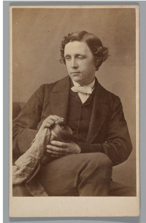
Lewis Carroll, 1863, Oscar Gustave Rejlander (British, born Sweden, 1813 - 1875). Medium: Albumen silver print. Image: 8.9 × 5.9 cm (3 1/2 × 2 5/16 in.) Image: 8.9 × 5.9 cm (3 1/2 × 2 5/16 in.). EX.2019.5.146.

In 1863 Rejlander constructed a unique iron, wood, and glass “tunnel studio,” where the sitter, positioned in the open, light-filled part of the studio, would look into the darker part of the room where the camera and operator were situated, nearly invisible. The pupils of the sitters' eyes expanded, allowing for “more depth and expression,” as a writer observed in Photographic News . In addition to this technique, Rejlander often exploited his own unique ability to enact exaggerated emotions to assist his subjects. Charles Darwin illustrated many of Rejlander's expressive photographs in The Expression of the Emotions in Man and Animals , published in 1872.